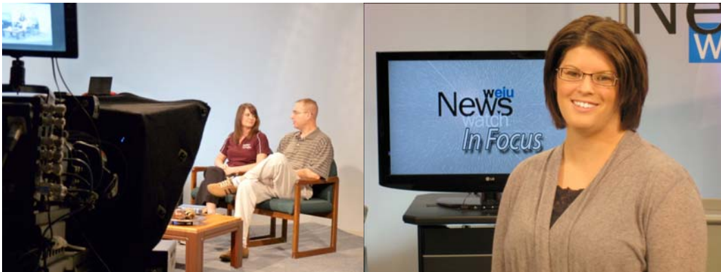
Photo on the top left: Community guests on the new local program “Being Well”.

The new local programs are produced by a production staff of 4, full time producers along with production assistance by Communication and Journalism students at Eastern Illinois University.